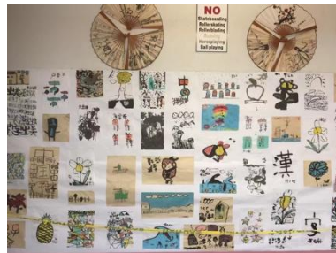
Summer Fun students' calligraphy and brush painting