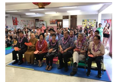
Our distinguished guests