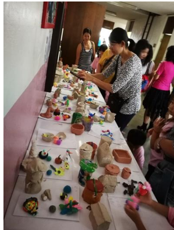
Summer Fun students' sculpture art work show