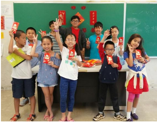
CNY traditional laisee