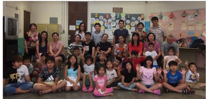
Summer School Happy time—teachers, parents and students