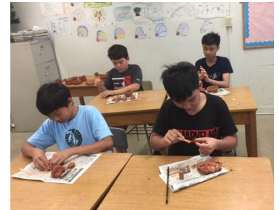
Summer Fun-- Students are taking sculpture and ceramic class