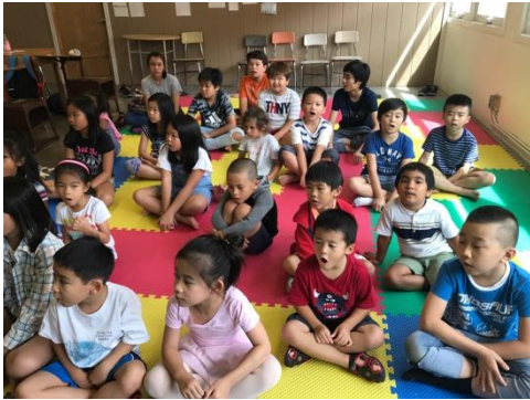
Summer School--Students are having singing class.