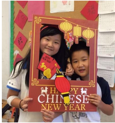
CNY picture taking