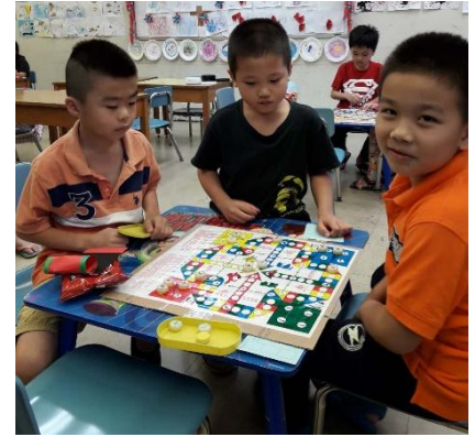
Traditional Chinese kids' Flying Chess