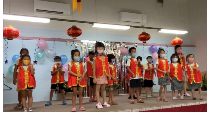
Students reciting Chinese poems on stage.