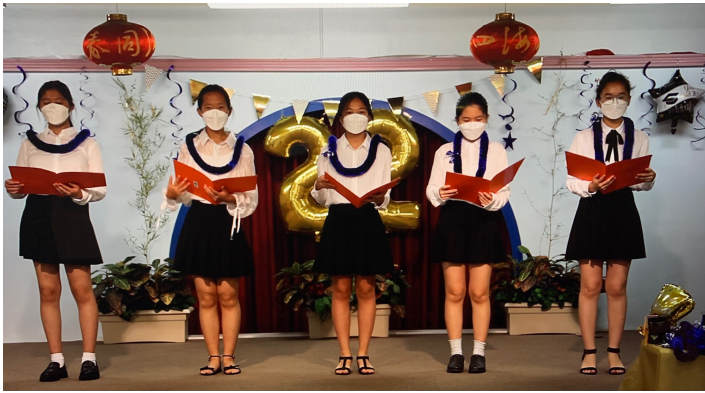
Weekday students performing a poetry recitation