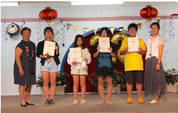
Students winning money awards in recognition of their excellence in 2021 Chinese Essay Competition