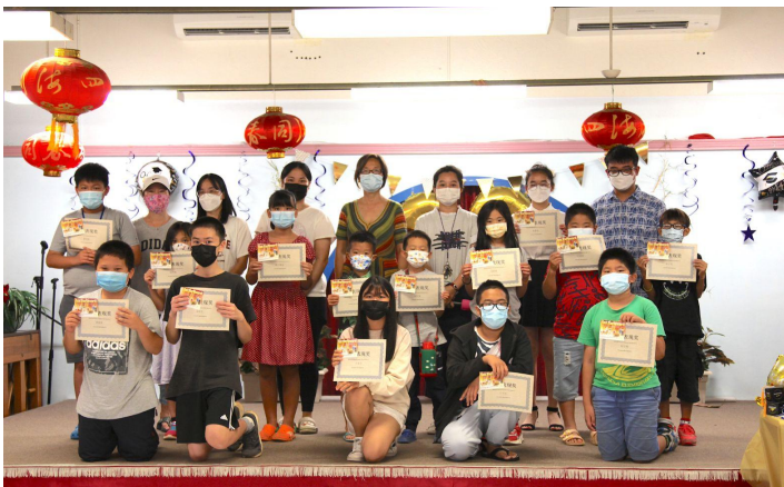
Students received Best Performance Award