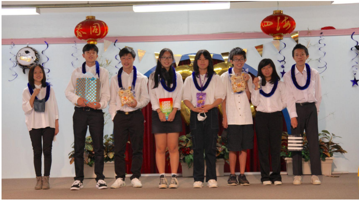
Weekend graduates having a gift exchange