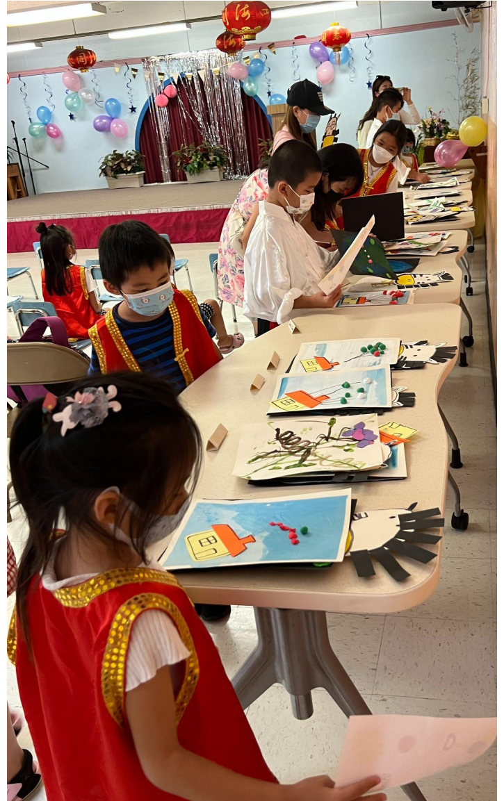
Students looking at their art showcase