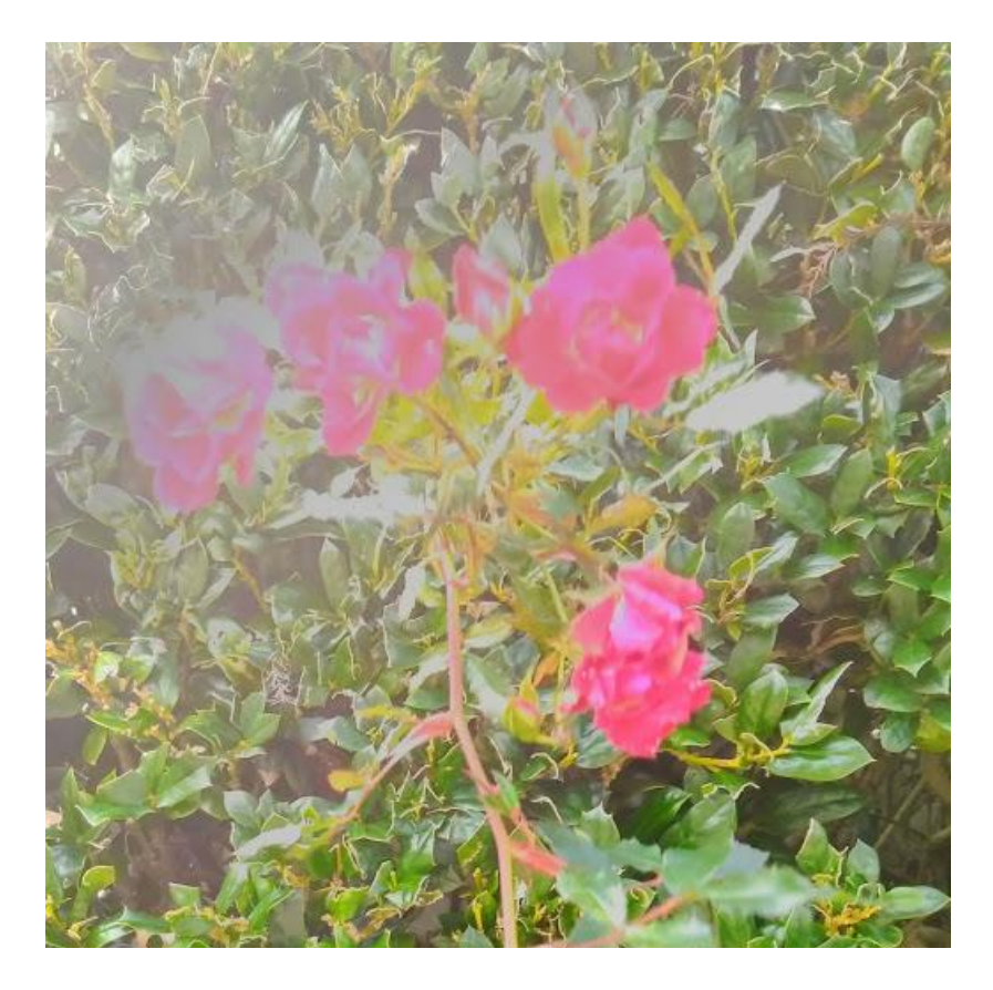
Heart of a Hedge

He charges at his reflection with all his zest, Until he falls down, into a wild flower bed. By instinct, his duty he does not neglect.