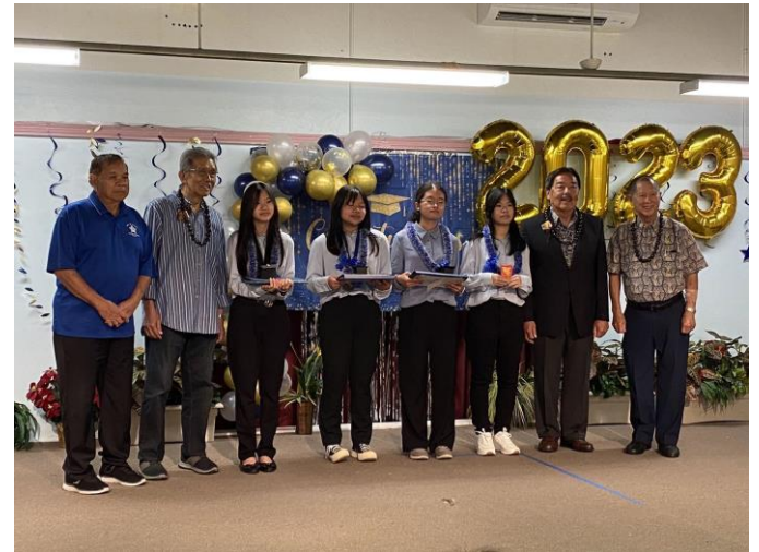
Celebrating Tradition: Former Presidents Inspire and Reward Our Graduates with Lai See.