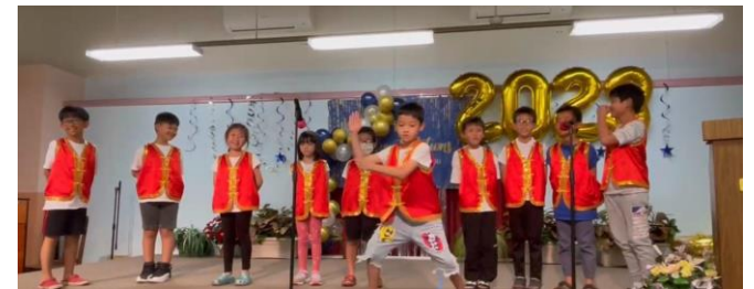
Second graders shine as they embrace their cultural heritage, singing 'Descendants of the Dragon,' while a talented student demonstrates impressive Kungfu skills.